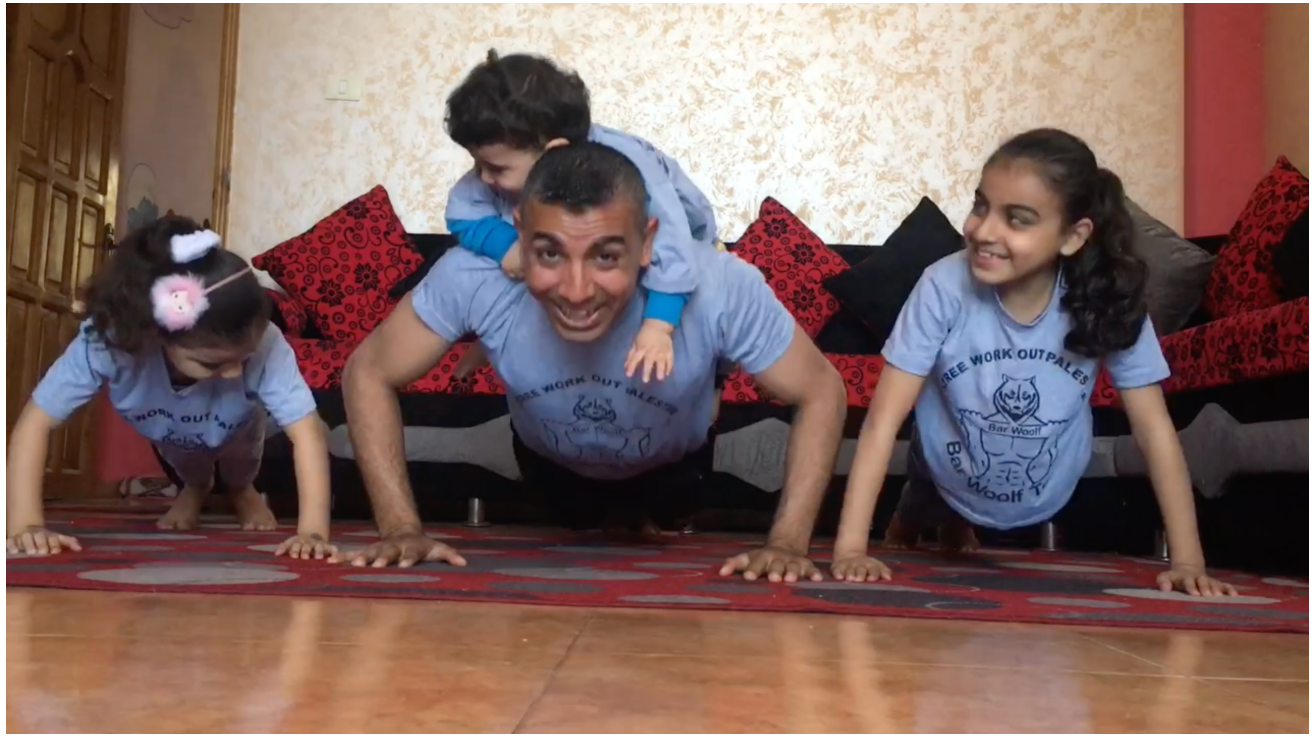
Back to www.hope-foundation.nl